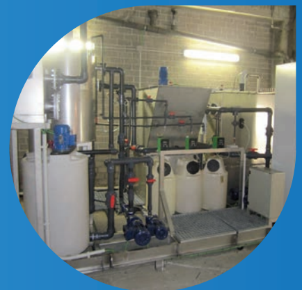
Innova Pilot Plant

By separating the two biomasses that perform nitrogen removal, the process involves a low ratio COD/N ratio plus an optimal use of oxygen, which is supplied with high efficiency because the membranes distribute it directly onto the biofilm, thus improving the hitherto low efficiency rates associated with bubble aeration systems. The thorough control of